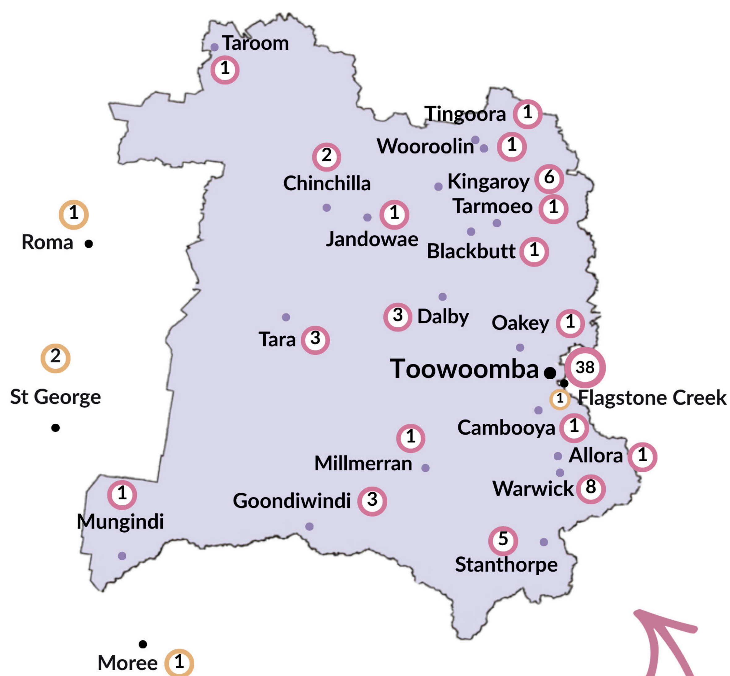
Figure 1. Geographic distribution of iron infusions organised through the perioperative anaemia service, including external sites outside of the DDH region.